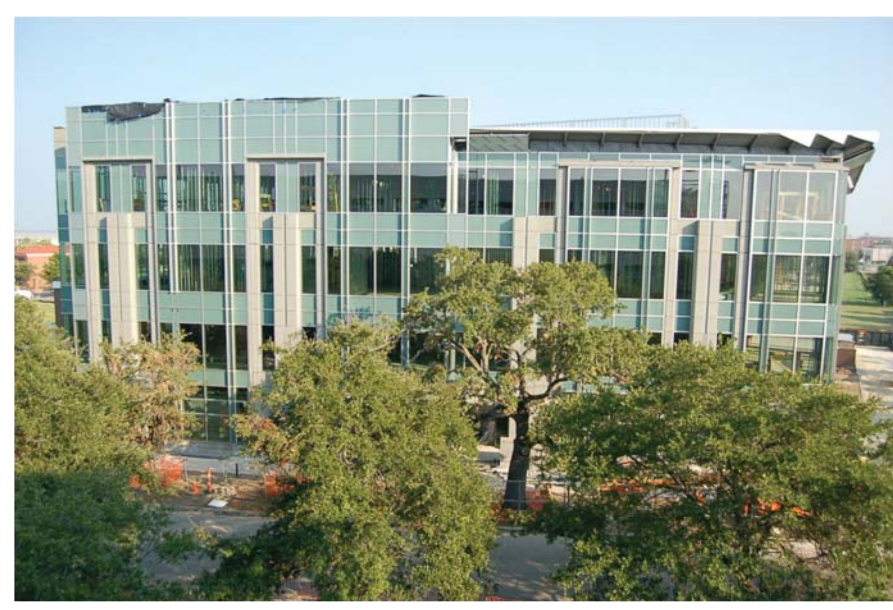
Our new building at 25 Calhoun Street